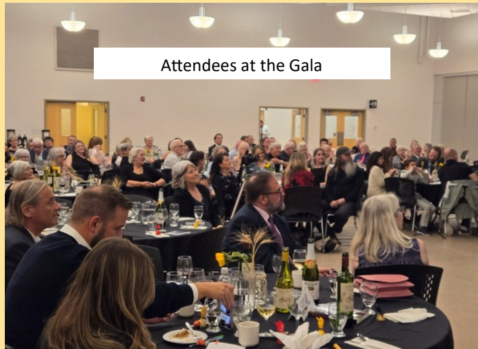
Attendees at the Gala