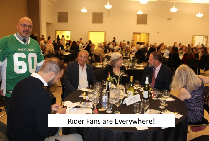
Rider Fans are Everywhere!