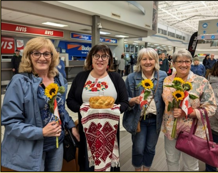
Greeting our guests from Ukraine at the airport