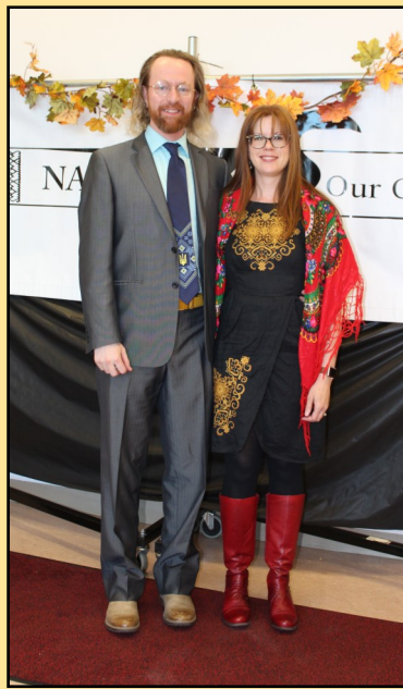
Some stylish local supporters