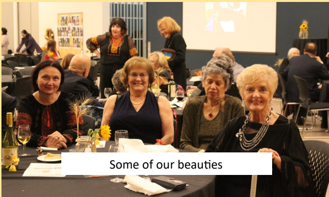
Some of our beauties