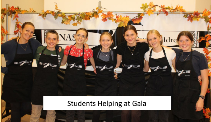
Students Helping at Gala