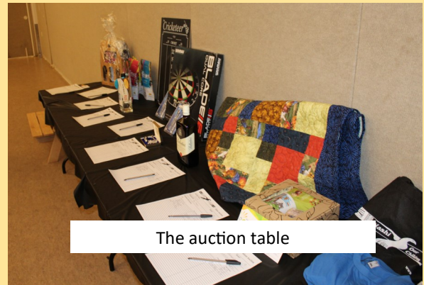
The auction table