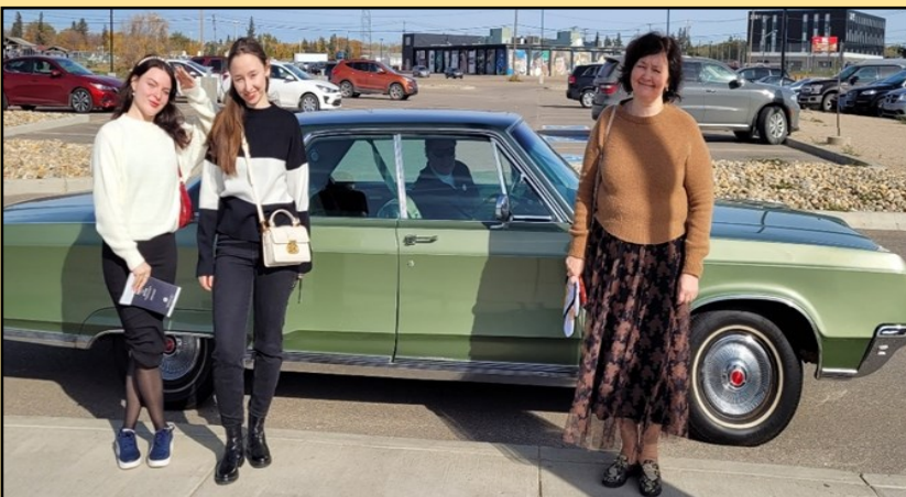
Off to the Western Development Museum in Style